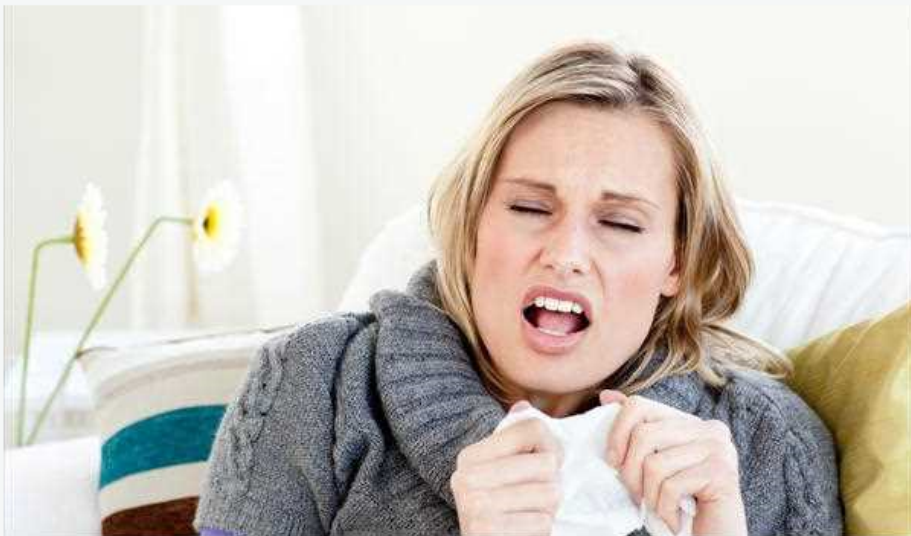
Sinus Pressure Sinus Pressure Symptoms Sinusitis Sinus

Allergens Viral infections Cold and flu Bacterial infections And other things that trigger allergies like mold, air dirt, pet dander and pollution.