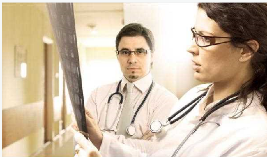
SinusitisChronic SinusitisSymptoms SinusitisTreating