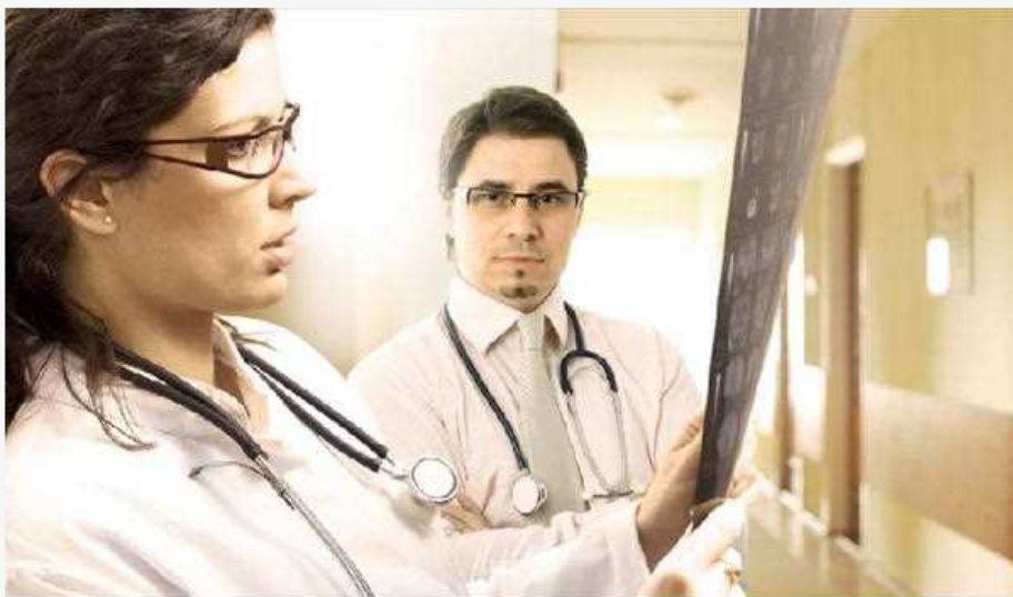
Sinusitis Swollen Sinus Sinus Treatment Headaches Blocked

Another common problem that is seen in most of the people is actually of snoring while sleeping. Pillar procedure is seen an likely remedy for snoring as well as sleep apnea. In a lighter vein it can be said that snoring is an instance of sound sleep. But it is not so. Snoring and sleep apnea is a medical problem that arises from the fluttering or tissue vibration of soft palate. Soft palate is the upper surface of the oral cavity separating oral and nasal cavities. In the above mentioned referred technique, three pillars are usually placed inside the soft palate making it stiff, therefore reducing vibrations which usually reduces snoring.