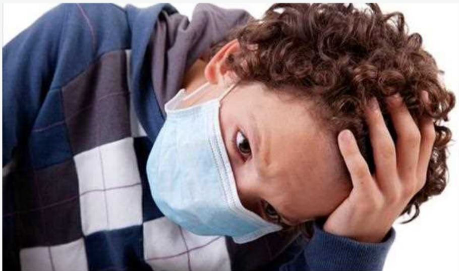
Sinusitis Sinus Surgery Endoscopic Sinus Surgery Chronic

Modern health clinics and nose centers provide complete take care of diseases of the nasal sinuses . Most of nose center presents full diagnostic, treatment and management services for patients with nasal and sinus worries. Specialists at the center are knowledgeable in the most recent nonsurgical surgical methods such as balloon catheter dilatation plus other endoscopic sinus surgery . However, patients should consult their doctor or specialist before trying anything fresh.