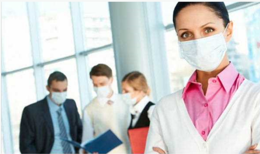
SinusitisSinus SurgeryChronic SinusitisHeadachesInflamed