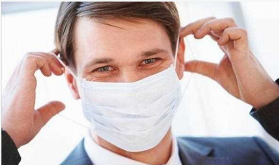
Nasal Congestion Sinus Problems

The information provided in this information had been created for educational purposes only all of which will not utilized to identify or deal with any kind of medical issues. Examples of vaporizers with great ceramic heating elements: Vapor - Brothers, Phedor and also Hotbox. Not that, the lower p - H may slow the reproduction of pests like thrips. They will more than likely help to destroy up virtually any mucous inside your system making your cough a lot more successful. Nasal congestion is due to cold, flue or allergy or perhaps as a result of dry air and also air pollution. Changing your sleeping position can often be need to ease the snoring.